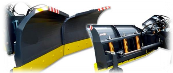
*example of the usage